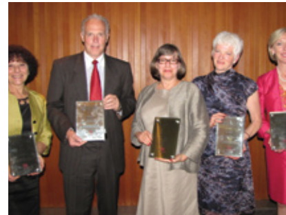
2010 Distinguished Service Award winners