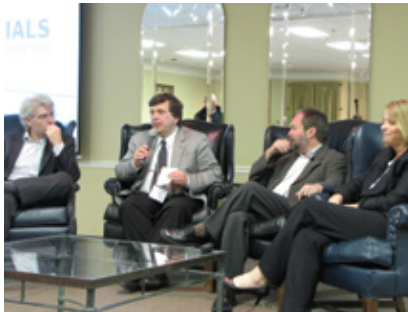
Plenary speakers, 2010 Annual Conference, Cornwall, ON