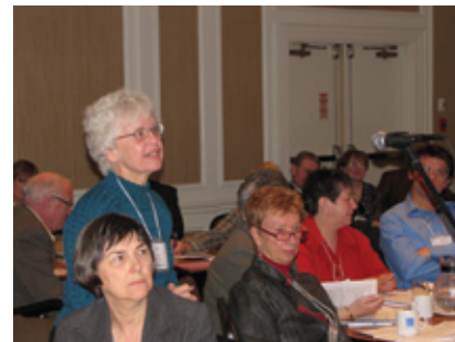
Board of Health Orientation Session, Feb. 2011