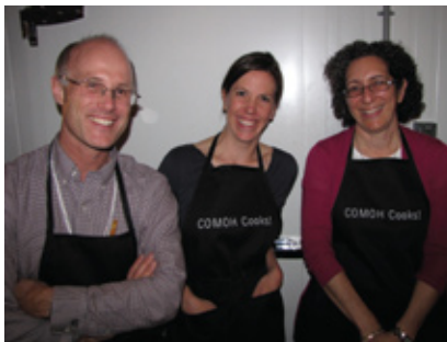
COMOH Leadership Retreat participants, Oct. 2010